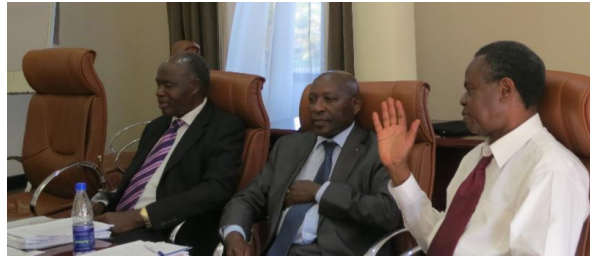
ACHEST board members.

The LMG Project is highlighting its partner, ACHEST, a grass roots African think tank based in Uganda that embodies what it means to be "country-owned."