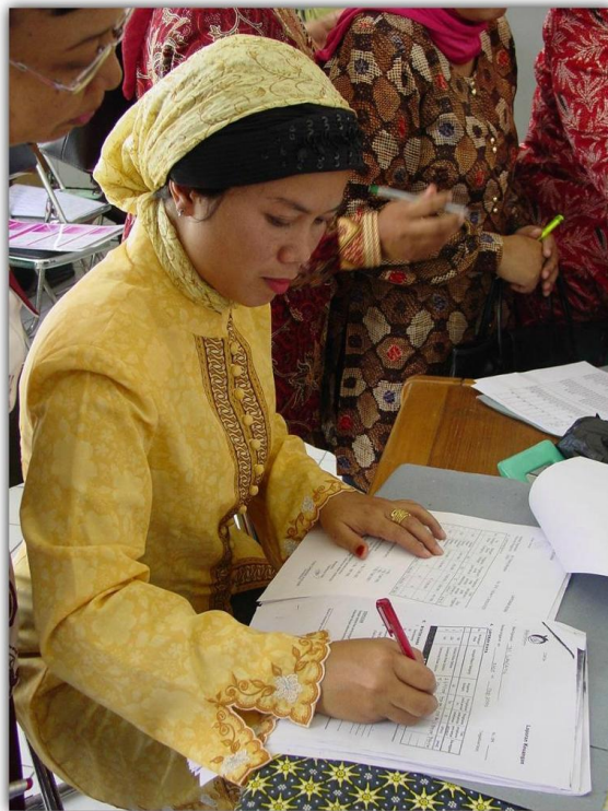
An East Java midwife fills in recruitment forms at a workshop for midwives in Indonesia.