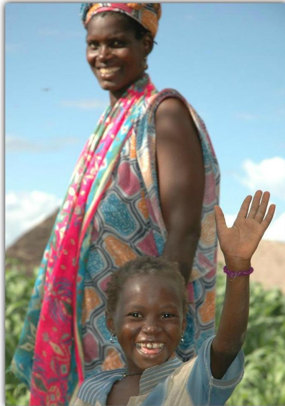
Rural health worker with child in Mali.

Universal Health Coverage (UHC) can have a positive effect upon the health of women and girls. Health leaders, managers, and those who govern should take this into consideration when strengthening their health systems.