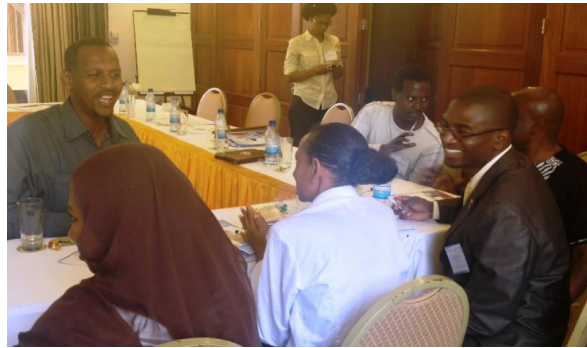
Participants during the SLP training in Tanzania.

The LMG Project and the International Committee of the Red Cross (ICRC) recently launched a Regional Senior Leadership Program.