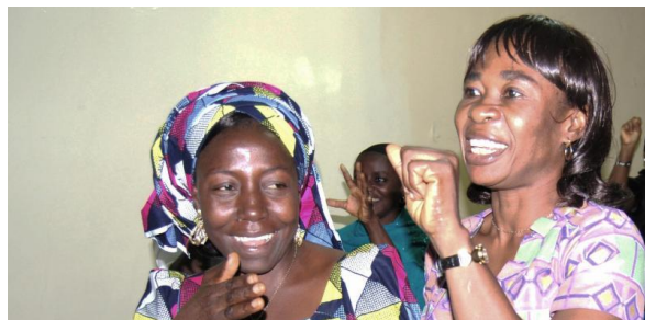
LDP+ participants at a recent training in Gwagwalada Council, Nigeria.